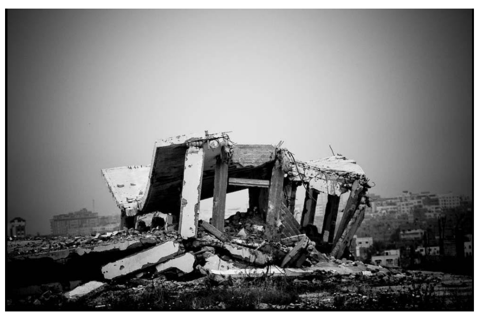
Khan Yunis, Gaza 2006

Israel's participation at DSEi is organised by SIBAT, a department of the Israeli government responsible for the IDF's arms procurement.